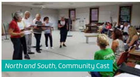
North and South, Community Cast